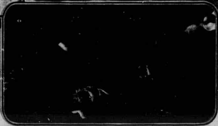
Red Cross first aid on the highway.