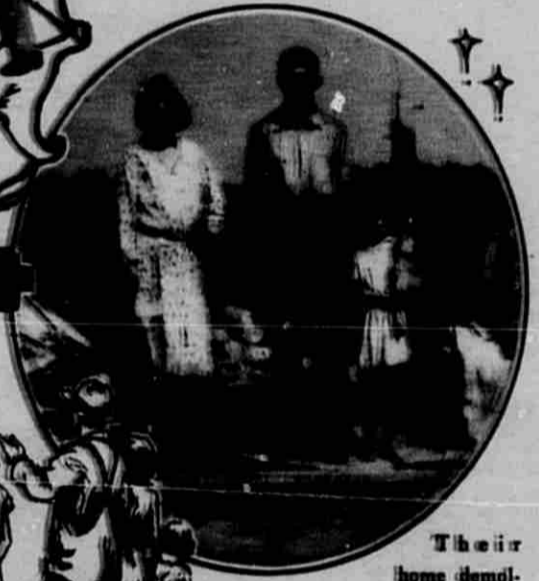
Their home demolished by a tornado, this Alabama family turns to Red Cross.

5,242,406 families provided with clothing.