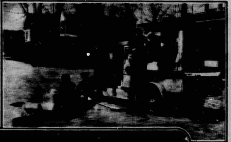
Red Cross volunteers carry food to homes insulated by Ohio river.