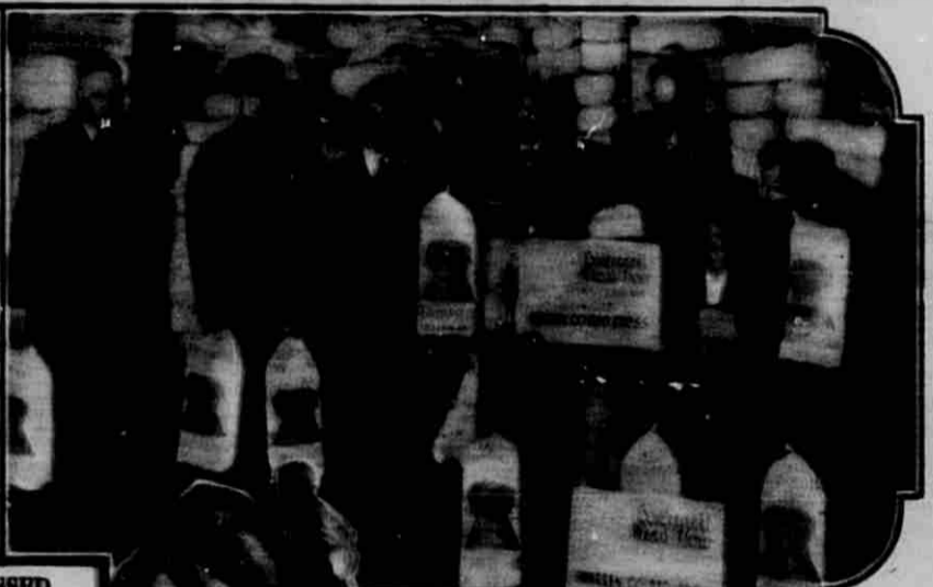
Ready to distribute Red Cross flour to the needy.

RED CROSS CLOTHES NATION'S NEEDY AND DISTRESSED