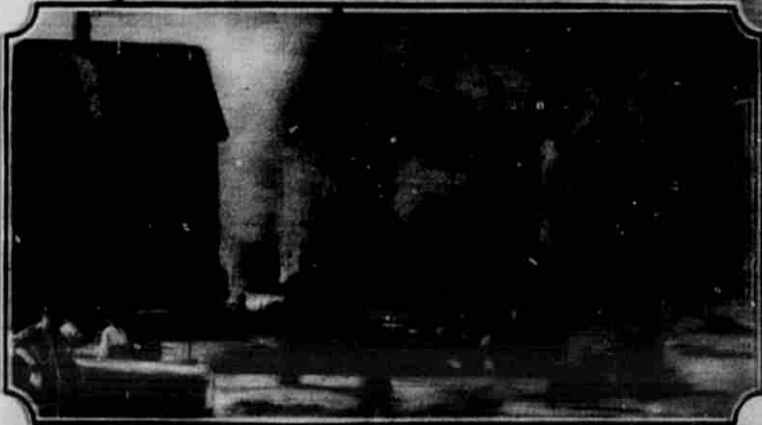
Red Cross aids homeless after destructive fires in Maine.